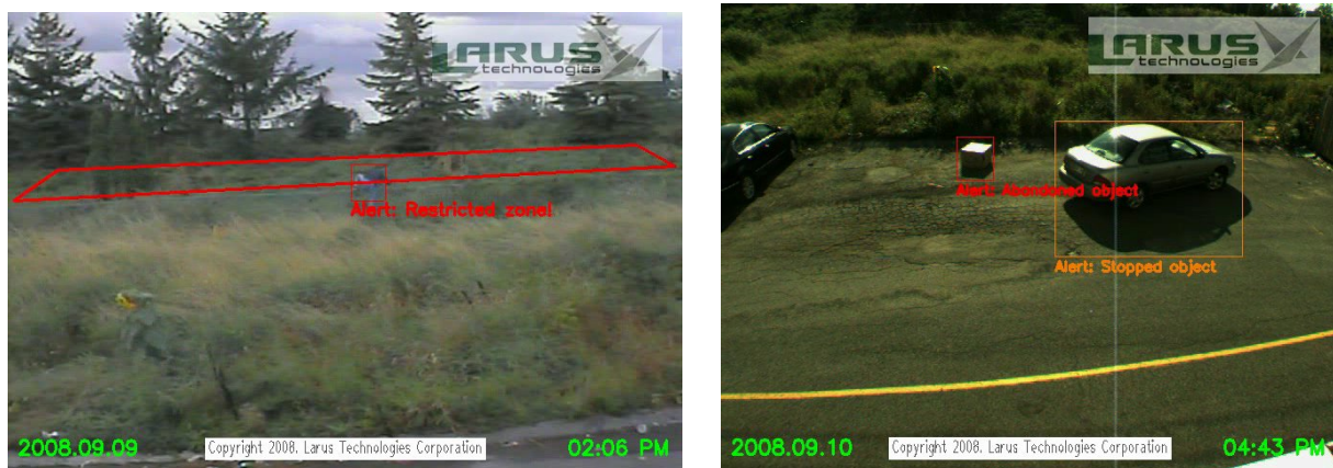
Figure 1. Detecting object intrusion (left), stopped, and abandoned objects (right).

Larus' state-of-the-art intelligent video analytics technology includes motion detection, object tracking, face/vehicle detection, and license plate recognition. For example, in Figure 1 (left), the system tracks movement of a foreground object, a person, crossing an operator-defined polygon denoting a fence. Moreover, Figure 1 (right) shows the tracking of a stopped object as well as an abandoned object. The detection capability is robust against compression artifacts, imperfect focusing, and certain changing environmental conditions (e.g. light wind, rain, lighting variability).